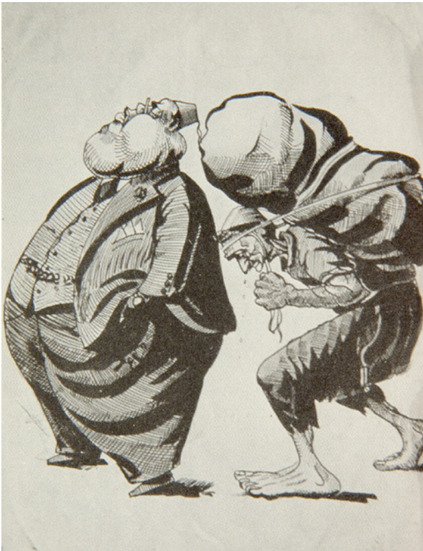
Fig. 4. Subhi Shouaib, A Mistake in Distribution (Khaṭā' fi-l-tawzī') , 1951, ink and watercolor on paper, 32 × 24 cm. (Reprinted from Said Tahseen, Subhi Shouaib, Syrian Plastic Arts Series 2 [Damascus: Salhina Printing and Publishing, 1989], 21.)

astonishing onlookers with its vivid content and unclassifiable style. 26 The elitist critic at al-Naṣr , for example, lauded the modern conceptualism of Isma'il's approach, writing that the literalism of preceding efforts had finally been overcome with a mode of distillation in accordance with the "rational scientific age." 27 Meanwhile, the newspaper al-Ishtirākiyya , the mouthpiece of the Arab Socialist Party, celebrated Isma'il's apparently populist mode of address: the use of bright points of color (such as the red sparks in the porter's head, thigh, and foot and the yellow in his face and spinal cord) to convey the "shining" physical and mental effort of his struggle directly to viewers, including those who were not "well-studied." 28 In the main, Syria's newspaper critics were fully engaged in emphasizing Isma'il's break