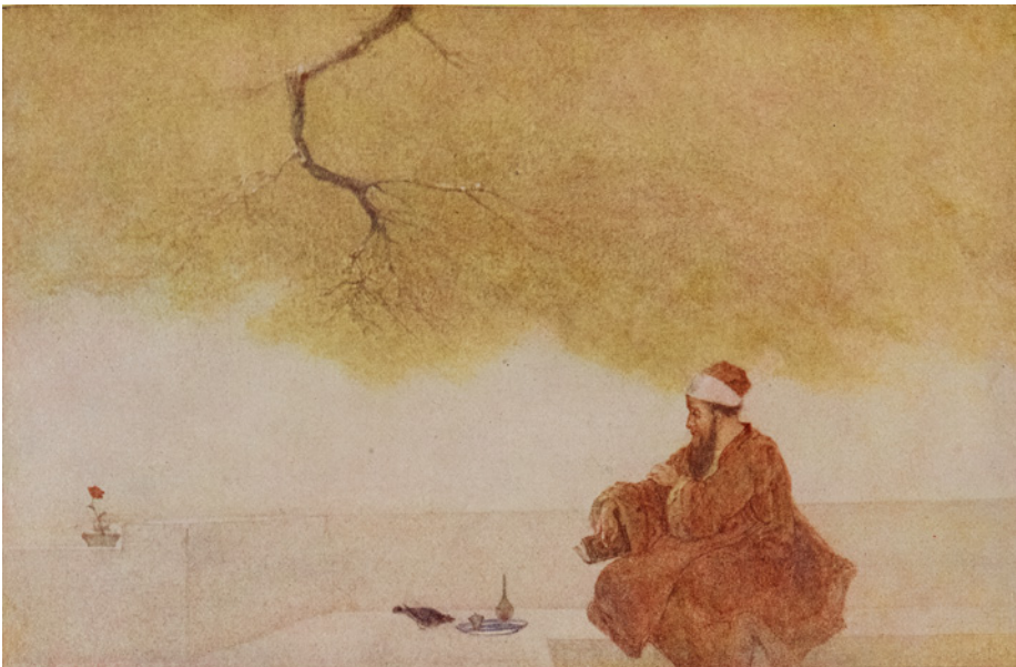
Fig. 19. Abanindranath Tagore, Nasim Bagh , 1902, watercolor. (Reprinted from "Les Jardins du Kashmir," L'Illustration no. 4103 [October 22, 1921]: 382–84.)