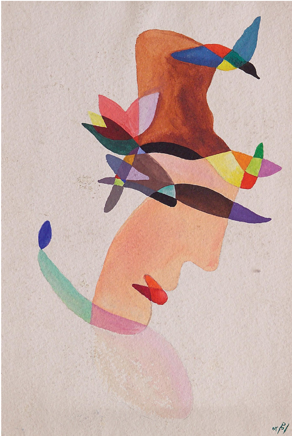
Fig. 22. Adham Isma'il, no title, 1953, gouache on paper. Samawi Collection, Dubai.