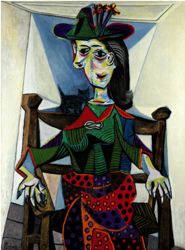
Fig. 9. Pablo Picasso, Dora Maar with Cat ( Dora Maar au chat ), 1941, oil on canvas, 128.3 cm × 95.3 cm. Private Collection. (Artwork: © 2017 Estate of Pablo Picasso / Artists Rights Society (ARS), New York.)

uncertainty into a consideration of mortality and immortality in painting. When he does write reflectively about the calamities of 1949, in an end-of-the-year poem that he composed for circulation among party comrades, he folds the life-to-death inversions of Isma'il's painting into a broader account of the Syrian government's procedural undoing of their natural talents. 81 One friend lives without a salary, another is a navigator without a boat, another has been passed over for the military, another gambles in politics for sport, another is a poet who has lost his voice, and so on, with his "painter brother" (Isma'il) left to listen to his own colors "weep" in the lightlessness of their world. In every case, Sidqi Isma'il writes, the succession of "coups, upturned things, and overturners" has changed very little, for,