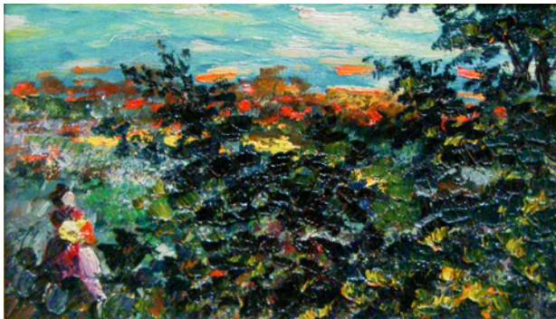
Fig. 11. Adham Isma'il, no title, 1940s, oil on canvas. Private collection, Damascus.

Isma'il retains the ambiguous internal relationships between facial profile and full-face rendering that make eyes, nose, and lips into floating signifiers. Yet he emphasizes the movement of the line over any sense of human personality, attenuating its twists and turns into a trace of movement or music. Heightening the impression of its self-contained suspension in space, Isma'il uses only washed tones of cream and pink beneath the painted lines and adds a hint of biomorphic energies in the final curling of the line into a shell or breast. If Picasso's woman suggests animal presence, then Isma'il's is an immaterial entity: curtains that flutter in the breeze, color that twists into dance, and a body that indexes a creativity that extends beyond either thing or self.