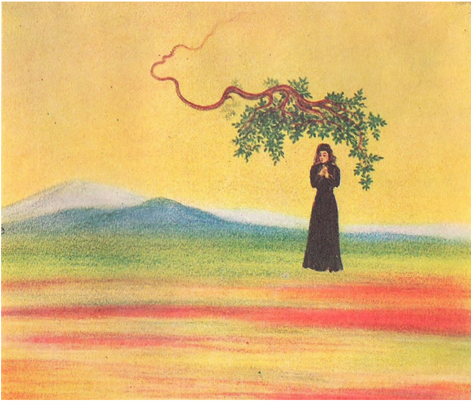
Fig. 18. Adham Isma'īl, Solitude (al-Wahda) , 1945, colored pencil on paper. (Reprinted from Na'im Ismā'īl, Adham Ismā'īl: Ḥarqat Lawn wa-Khaṭṭ Lā-Nihā'ī [Damascus: al-Jumhuriyya Press, 1965].)