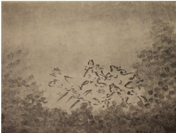
Fig. 21. Adham Isma'īl, Dabke , 1950, oil on unknown surface. (Reprinted from Na'im Ismā'īl, Adham Ismā'īl , 27.)

Arab cultural identity, they are not ethnographic in purpose. Instead, each manages the relationship between idealized form and folk practices by means of (imagined) rhythm, letting rhythm act as a mediating presence as well. That relationship, established across nested realms of being, is at once natural, replicative through the body, protean, and transcendent.