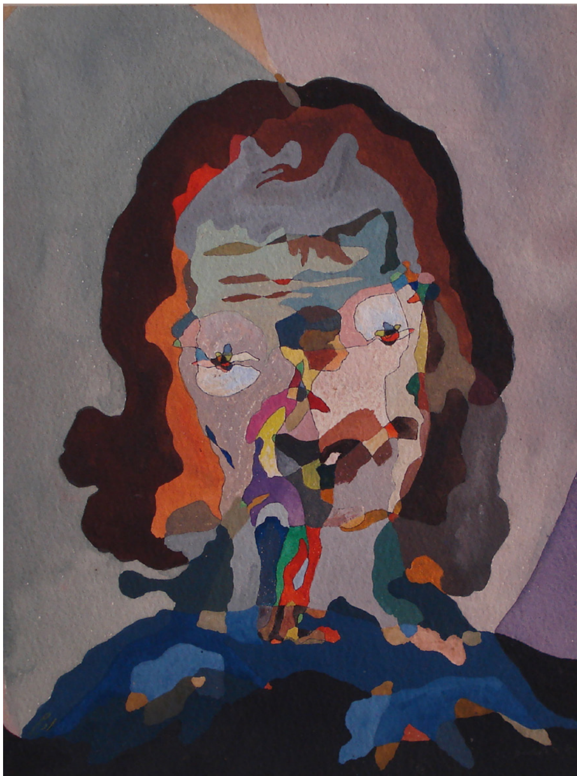
Fig. 7. Adham Isma'il, no title, 1952, gouache on paper. Agial Gallery, Beirut.