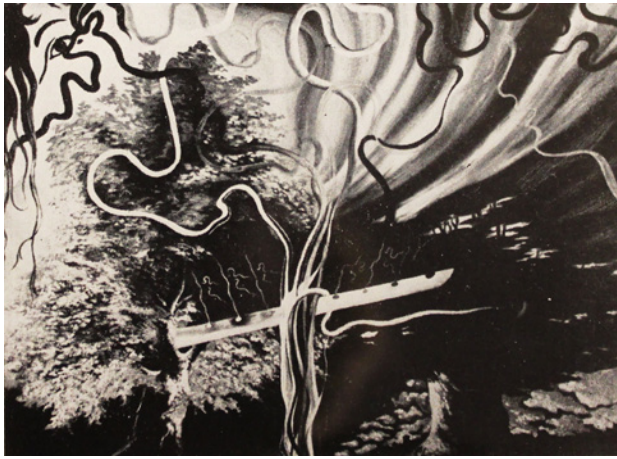
Fig. 20. Adham Isma'īl, Syrian Zajal (al-Zajal al-Sūrī) , 1947(?), oil on unknown surface. (Reprinted from Na'im Ismā'īl, Adham Ismā'īl , 14.)