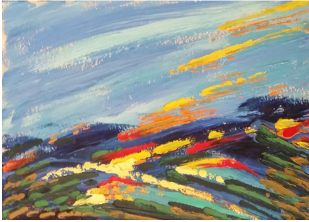
Fig. 10. Adham Isma'il, no title, 1940s, acrylic on paper, mounted in an album. Private collection, Nicosia.