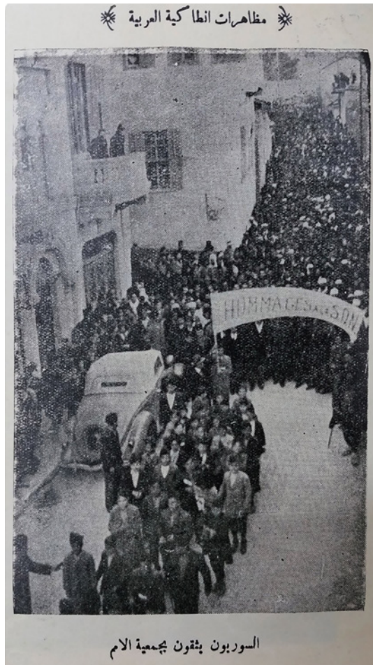
Fig. 8. Photograph of protests staged in Antioch for the January visit of the League of Nations commission. The captions read “Protests of Arab Antioch” and “Syrians Depend on the League of Nations.” (Reprinted from Committee for the Defense of Alexandretta, Irādat al-‘Arab Taḍmanu Ḥuqūqahum: al-Iskandarūna ‘Arabiyya Raghma Kull Quwwa [Damascus: Ibn Zaydun Printers, 1937].)