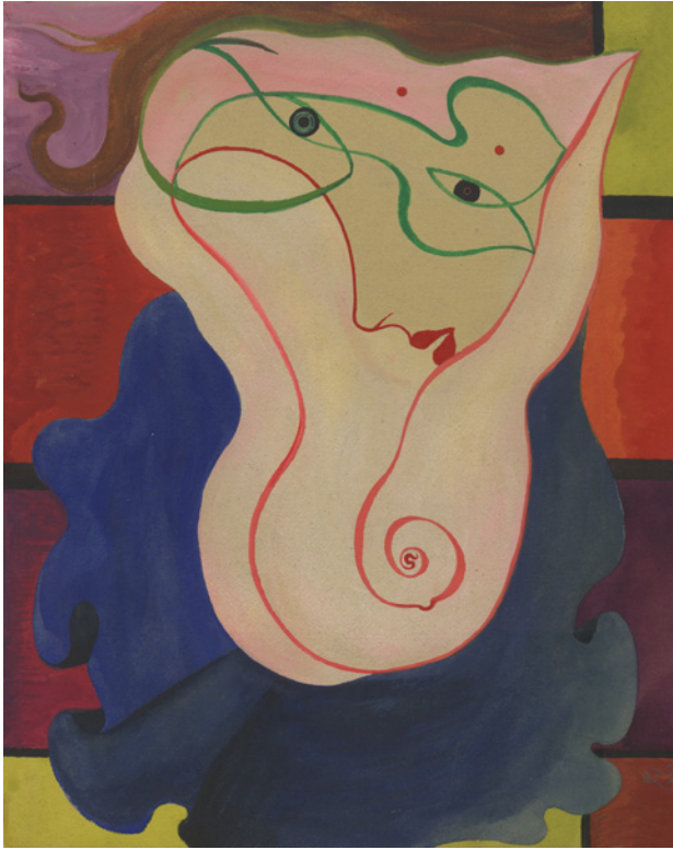
Fig. 5. Adham Isma'il, no title, 1948, gouache on paper. Private collection, Damascus.