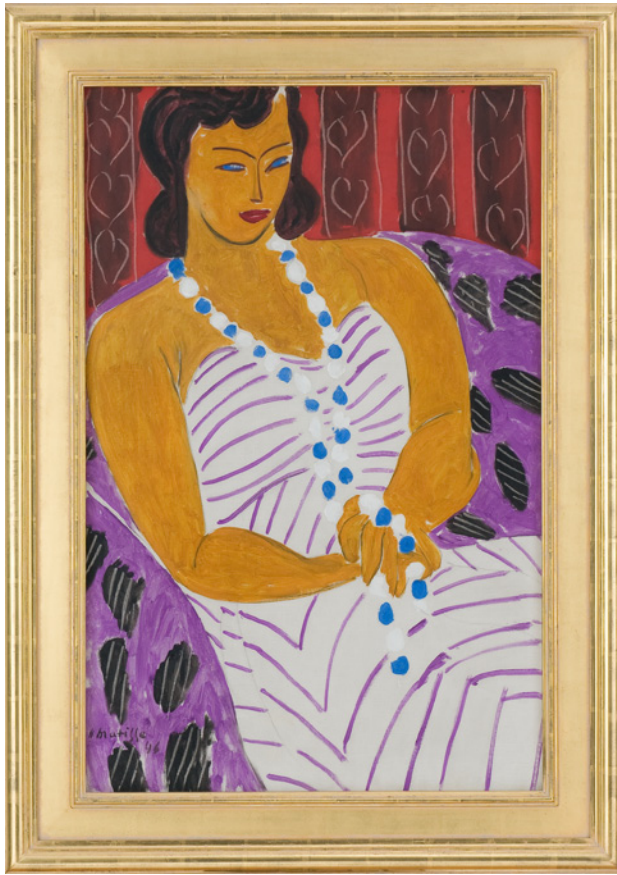
Fig. 15. Henri Matisse, Woman in White ( Dame à la robe blanche ), 1946, oil on canvas, 96.5 × 60.3 cm.

the moment, for he takes liberties with its function as an analytical term and puts greater stress on its significance as a form of Arab identity. For example, he opts not to print the term in Roman characters (as the journal did for the artists' names), nor to transliterate it (as Syrian critics would do in the 1960s), nor to make use of the term raqsh , from the verb raqasha , meaning to variegate or make multicolored (the coinage that Farès officially proposed in 1953). 148 Instead, al-Kasim uses the phrase tazayyunāt 'arabiyya , which has the very literal meaning of "Arabic decoration." Relating more to the modalities of artisanal work than to those of fine arts, this phrase casts French artists who employ the arabesque—Toulouse-Lautrec, the Nabis, and the like—in the role of composers working with the codified forms of Syrian