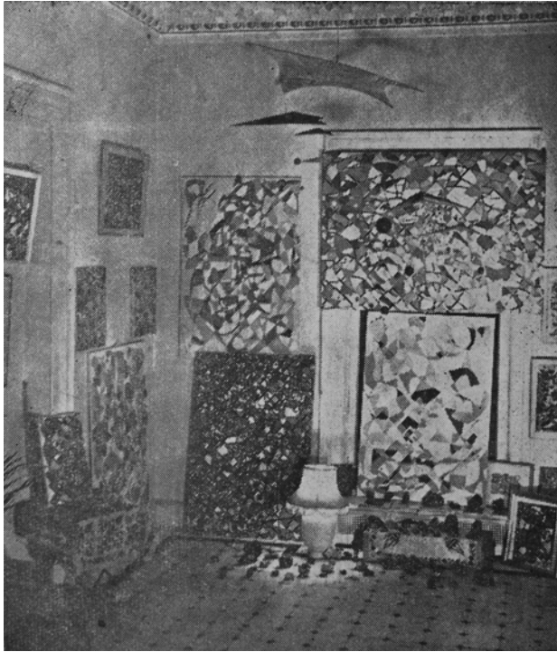
Fig. 13. Photograph of Fahrelnissa Zeid's home studio, 1949 or 1950. (Reprinted from Jamil Ḥamūdī, "al-Amīra al-'Irāqīyya Fakhr al-Nisā' Zayd," al-Adīb 9, no. 3 [March 1950]: 9–12.)

lamic art, as Oleg Grabar notes in his landmark study The Formation of Islamic Art , the arabesque might best be understood not as an innovation per se but rather as a way of treating forms syntactically and of producing ornament through the endless repetition and modification of shapes. As Grabar also notes, the ambiguity of the arabesque creates a fundamental challenge for interpretation: as it seems to present both iconographic and ornamental meaning simultaneously, it is experienced as a "parallelism of contradictory sorts of meanings." 113 Whereas Grabar offers his description of this parallelism in a cautionary way, the artists of the nouvelle École de Paris milieu often courted the ambiguity of arabesque as a sign of artistic progress, wherein a representational motif might be distilled into pattern and vice versa. We see this in Hamoudi's commentaries on work in France, certainly, in which the term "arabesque" signals a revival of native resources and a rapprochement with Parisian modernism. 114 And we also see it in his selection