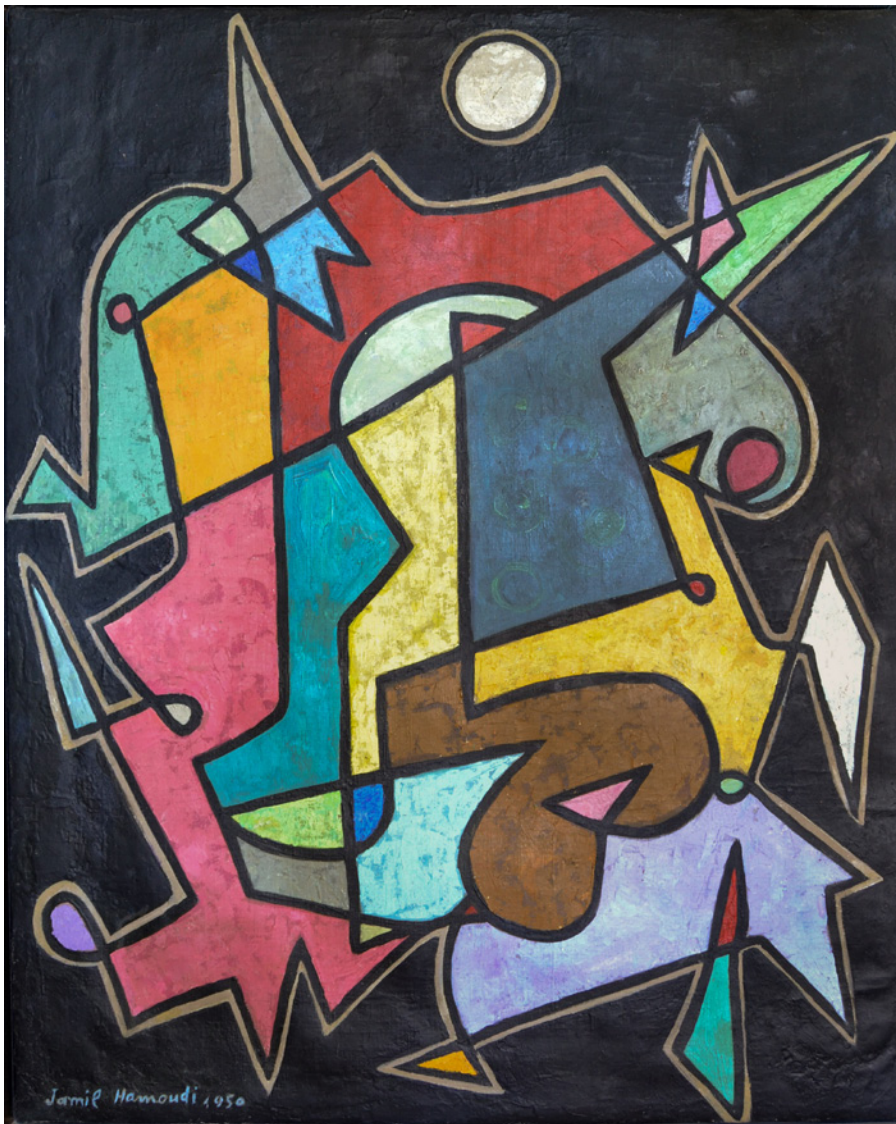
Fig. 12. Jamil Hamoudi, Don Quichotte , 1950, oil on canvas. Private collection, Baghdad.

Here is where the term "arabesque" enters, the mode or "structure" of surface design that Islamic art scholarship has long upheld as exemplary of the Islamic religious-cultural system, but which also plays a role in the historiography of the École de Paris and Romantic literature and music (though I will not address that here). 112 From the viewpoint of the first centuries of Is-