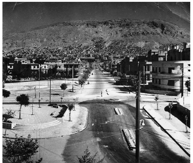
Fig. 3. Abu Rummana Street, 1940s, photographic view through new suburbs toward Qasiyun Mountain.

ment to Arab-Islamic modes of ornamental expression based on twisting, doubling, and mirroring lines and, at the same time, the modern prestige of the technique in the world’s canon of formal devices. 25 In the moment of its 1951 debut, however, descriptive responses varied widely as newspapers reported that it grabbed attention,