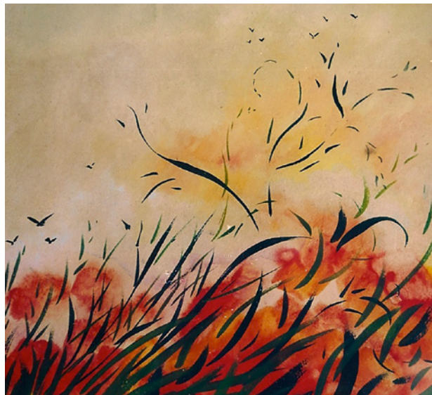
Fig. 6. Adham Isma'il, Warm Breeze (Nasama Hārra) , 1948, watercolor on paper. Private Collection, Nicosia.

closure as picture—as if to signal their allegiance to a different force (fig. 7). As such, Isma'il's body of work invites closer exploration of the tensions implicit in the Eurocentrism of the postwar historiography of modern painterly arts, which placed Paris-based modernists such as Henri Matisse at the head of a single continuous development into ever more perfect abstraction. 32