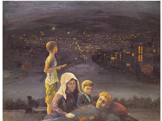
Fig. 2. Adham Isma‘il, Family of Refugees in Abu Rummana Street ( Usra min al-Lāji‘īn fī Shāri‘ Abū Rummāna ), 1950, oil on canvas, 65 × 85 cm. Samawi Collection, Dubai.

Syrian critics later settled upon the term “arabesque” to describe the technique Isma‘il employed in The Porter , thereby invoking both a heritage-oriented commit-