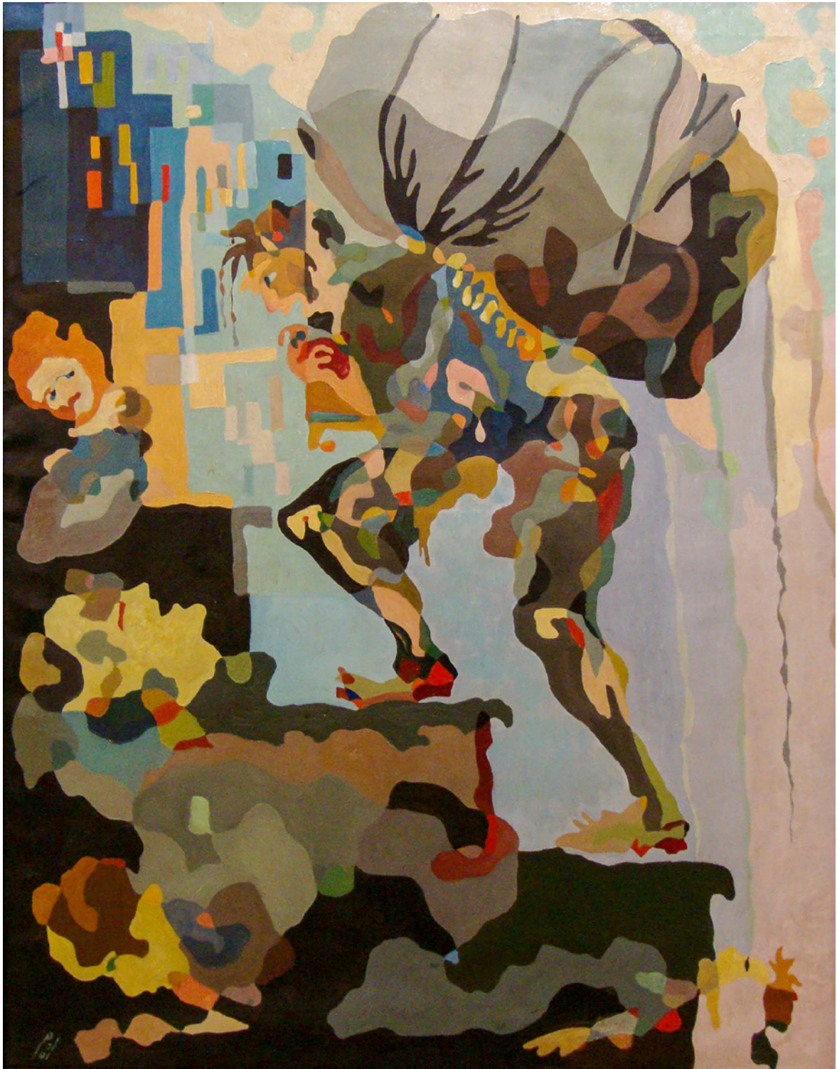
Fig. 1. Adham Isma'īl, The Porter (al-Ḥammāl) , 1951, oil on canvas, 80 × 100 cm. National Museum, Damascus.