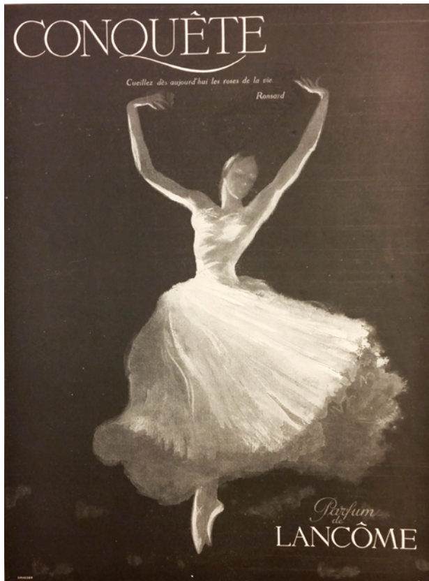
Fig. 17. Print advertisement for Lancôme perfume, “Conquête,” in L’Illustration , November 15, 1941.

century, distinguished by the watercolor wash techniques that imbue the spare compositions with atmospheric luminescence. 158 One 1902 Tagore watercolor, which depicts the Mughal king Shah Jahan in solitary reflection in his garden, where he sits beneath a tree branch gathering a cloud of delicate mist, circulated widely in Europe in the 1920s as an illustration of V. C. Scott O’Connor’s exotic travelogue The Charm of Kashmir (fig. 19). 159 Isma’il’s Solitude drawing employs a modal composition of person and atmospheric blankness that is akin to Tagore’s image of noble asceticism, albeit with the further stylization of its elements into a rounded S-curve of the branch against bright striations of color in pink, green, blue, and gold. Amid such fugitive visual qualities and their suggestion of Eastern metaphysics, this S-curve becomes more an abstraction of ephemeral energies than a depiction of things. The artist