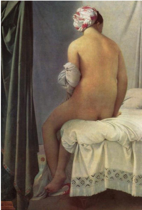
Figure 12. Jean Auguste Dominique The bather of Valpinçon , 1808. Musée du Louvre.

woman with the boom box and others may amuse at first glance, the overall effect on the photograph and the viewer's experience is a powerful, and Ghadirian's combination of past and present details in her portraits of Iranian women is reflective of the position of women from the "Orient" in between popular culture and day-to-day life.