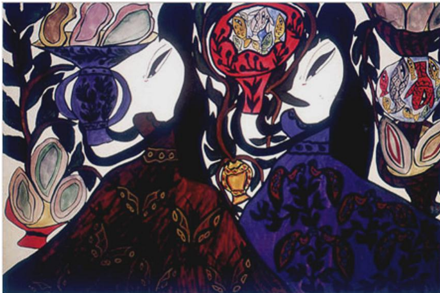
Figure 8. Baya Mahieddine, Femmes portant des coupes , 1966. Institut du Monde Arabe

Mahieddine, whose work centers on female subjects, employs a calligraphic style of painting in her work and using intricate decorations and Arabesque patterns resulting in works filled with “intricate decorative and repetitive rhythmic patterns reminiscent of Arabic calligraphy, Islamic art and oriental carpet.” 22 This combination of historical artistic traditions to showcase female subjects from a fresh and non-Orientalist perspective is a strategy that ought to elude Western categorizations of her art. Mahieddine, was frequently labeled as ‘exotic and’ categorized by many Western critics as employing a “naïve” or “primitive” style. Some critics went as far as to define her work in the context of the original source of Orientalist fantasy— A thousand and one nights . 23