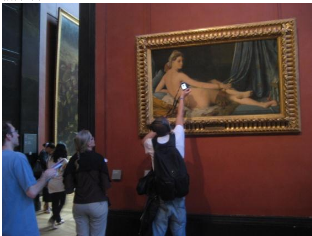
Figure 6. Tourist at the Louvre, 2009.

Whether drawn in by artists' use of color, painting technique, exotic locales or sexualized subjects, the images of women and the Orient in paintings such as Grande odalisque and the Women of Algiers have captivated artists and audiences for almost two centuries. Delacroix once wrote he would like to come back in a hundred years and see what the public remembered of him and his art works. 18 The artist would, no doubt, be surprised to see how Women of Algiers and his other works have influenced perceptions of foreign women for many artists and scholars over generations.