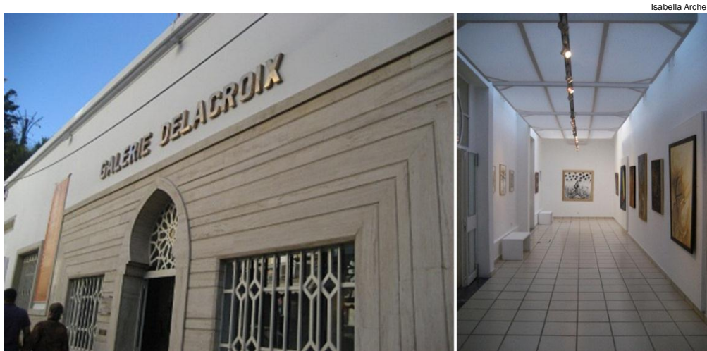
Figure 16. Outside and interior of the Galerie Delacroix in Tangier, Morocco.

modern facility that exudes class and modern design with only the most subtle tributes to North African and Islamic architectural styles in the building's windows and door frames.