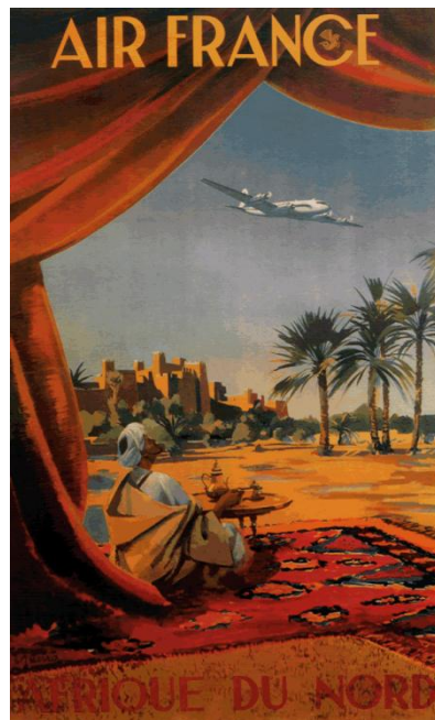
Figure 14. Air France Afrique du Nord , 1958, Air France. Guerre.

societies. I soon grew accustomed to seeing these posters on display in many hotels and restaurants, as well as for sale along the main thoroughfares in the touristy parts of the medina. But the posters would surprise me outside Morocco months later at a meeting in the chair's office in the Department of Asian studies. The sight of the same Air France poster of a North African man looking at a plane (flying suspiciously low to Marrakesh) seemed to me an indication that these posters, first printed in the 1920s, continue to play a visible role in advertising a voyage to the Orient as well as specific images of North Africa.