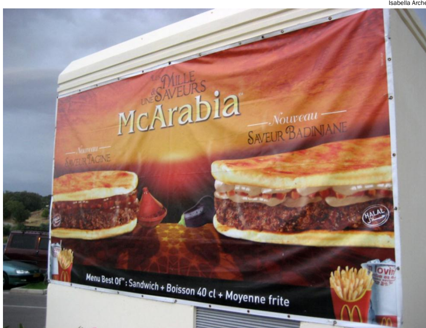
Figure 1. McDonald's advertisement in Fes featuring the "Thousand and one Flavors" of McArabia, including "Saveur Tagine" and "Saveur Badinjane."

Deborah Root writes that "exotic images and cultural fragments do not drop from the sky but are selected and named as exotic within specific cultural contexts; certain fragments of a cultural aesthetic are selected and rendered exotic, whereas others are rejected." 2 Given the popularity of both couscous' and McDonald's among Moroccans, which one is the "authentic" dish? When tourists come to Morocco, they want to sample 'authentic' native dishes, not the food they consume at home. Couscous is the authentic Moroccan meal because it is a dish that has been around for centuries, takes time to prepare, and is the center of the family meal on Fridays, a holy day in Morocco. The age and endurance of this tradition qualifies couscous as authentic. McDonalds, despite its popularity, is still regarded as American fast-food and as such, is rejected by tourists as an authentic icon of Moroccan culture—McArabia or no McArabia.