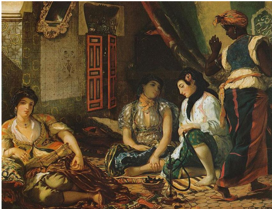
Figure 2. Eugène Delacroix, Women of Algiers in their Apartment , 1834. Musée du Louvre.

hanging in Moroccan households and restaurants. Artwork depicting traditional subjects and scenes is generally more popular than more modern, abstract art. The tourism industry in Morocco also provides many Moroccans—artists and others who do business with foreign travelers—with an incentive to promote traditional (and sometimes imagined) cultural products and experience for visitors seeking an “authentic” experience abroad based on Delacroix-like images of the Arab world.