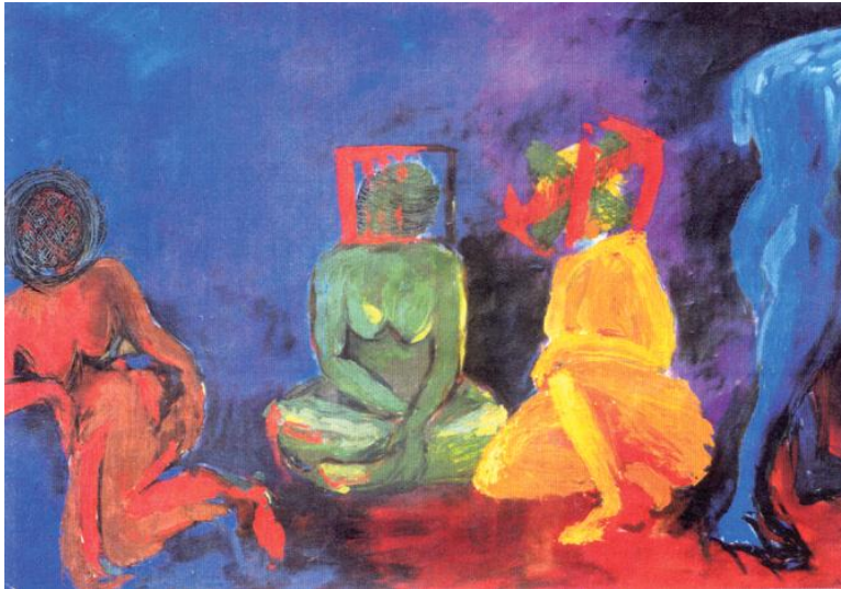
Figure 10. Houria Niati, No To Torture , 1982. London.

Niati depicts the figures, stripped of the clothing, jewelry, and other details that define the setting of the painting as a North African harem. Devoid of any detail, the figures are painted in the same positions as Delacroix's Algerian women, but in bright bold colors, their faces obscured by brush strokes. The effect is startling, and the objectification of the women, who look as though they are being viewed by a heat sensor, faces obscured by a large X, a cube