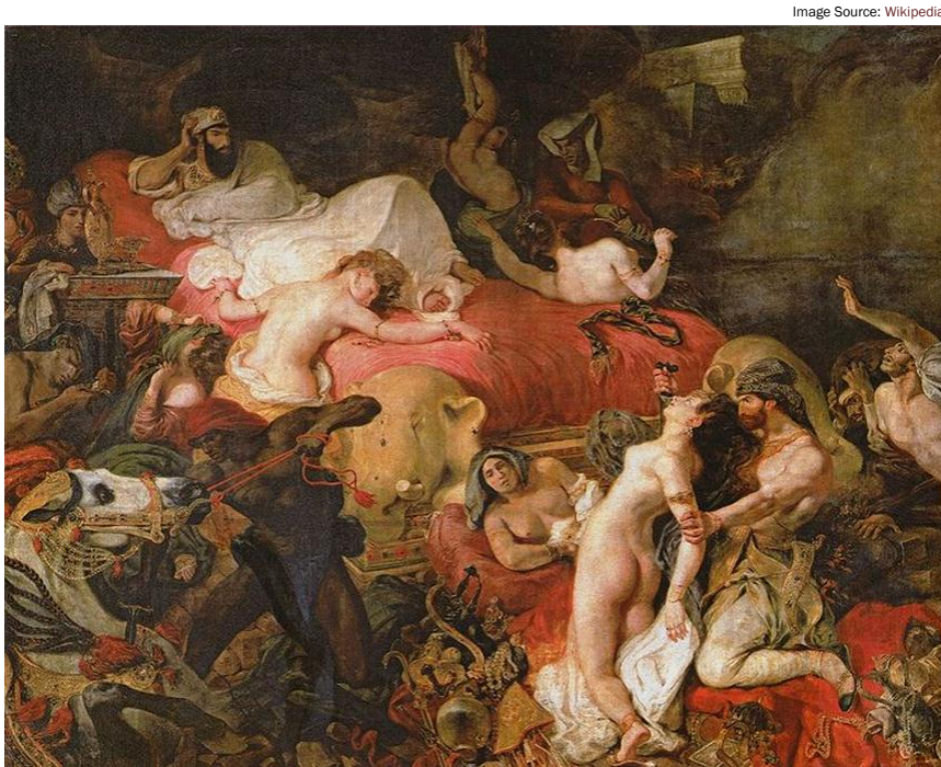
Figure 3. Eugène Delacroix, The death of Sardanapalus , 1828. Musée du Louvre.

Morocco would impact both the French Romantic movement in painting as well as audiences' understandings of what constituted the authentic Oriental "Other" by bringing fresh and vibrant colors and life to the European art world.