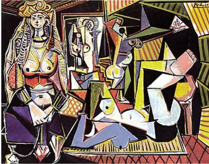
Figure 9. Pablo Picasso, Women of Algiers in their apartment (Version O) , 1955. Musée Nationale d'art moderne, Centre Georges Pompidou.